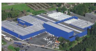
Hörmann KG Amshausen, Germany