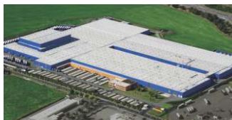
Hörmann KG Ichtershhausen, Germany