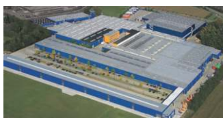
Hörmann KG Brockhagen, Germany