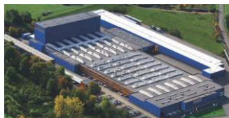
Hörmann KG Freisen, Germany