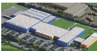
Hörmann KG Antriebstechnik, Germany