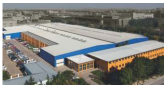
Hörmann Beijing, China