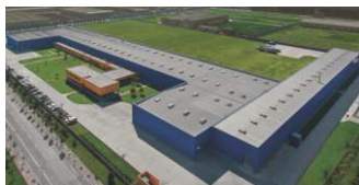
Hörmann Tianjin, China