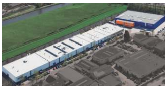
Hörmann Alkmaar B.V., Netherlands