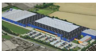
Hörmann KG Brandis, Germany