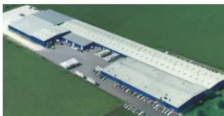
Hörmann LLC, Montgomery IL, USA