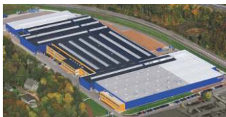
Hörmann KG Eckelhausen, Germany