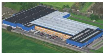
Hörmann KG Werne, Germany