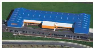
Hörmann Flexon LLC, Burgettstown PA, USA