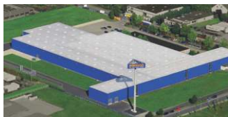
Hörmann KG Dissen, Germany