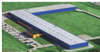
Hörmann Legnica Sp. z o.o., Poland